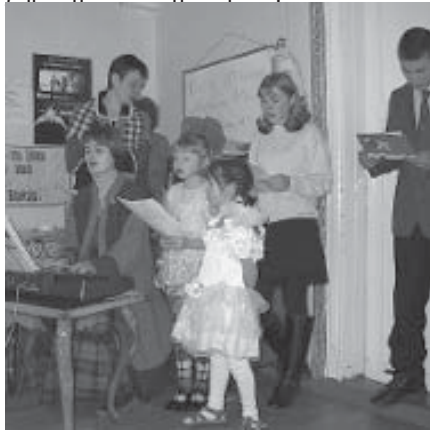
Lutheran Sunday School children from Touim, Siberia share their faith at an orphanage in Tselinny.

S: When I got caught on something during the play and at the same time I tried to turn around; I could hardly stand up. That would have been terrible if I had