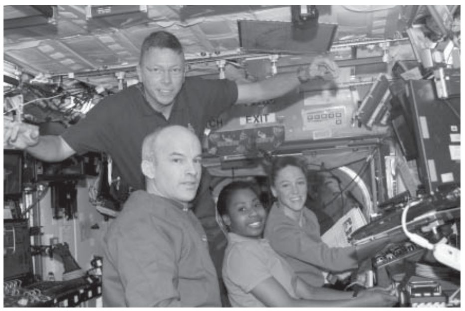
Two LCMS members recently had a “church council” meeting—in outer space! Astronaut Jeffrey Williams (foreground) is NASA science officer and flight engineer with Expedition 13 to the International Space Station. He travelled to the ISS on a Russian spacecraft on March 29, and will be in outer space until September 24. Astronaut Michael Fossum (standing) arrived with his crew on the Space Shuttle Discovery on July 4, and they remained until July 17 performing maintenance and upgrades to the ISS. During the mission Fossum participated in a 7½ hour space walk. Williams and Fossum are among five NASA active duty astronauts who are members of Gloria Dei Lutheran Church (LCMS), Houston, which is located just across the road from the space center and where some 30 percent of the congregation’s members are affiliated with the space program. Pictured with Williams and Fossum are Astronauts Stephanie Wilson and Lisa Nowak.

Formatting Errors on this page due to PDF Processing