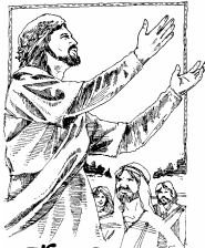
The Sermon on the Mount

In the tract rack in the Gathering Room is the tract Resources for Preparing for Confession and Communion . Included are self-examinations questions based on the Ten Commandments. You are invited to use this tract either at home or during the period of meditation in the Sanctuary before the service begins. As space allows we will also include portions in the bulletin.